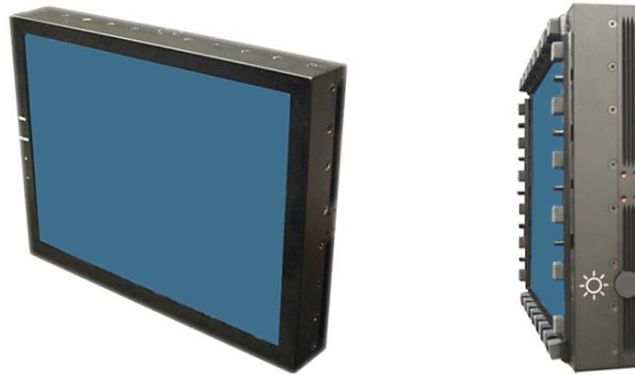
ARD10 – Rugged 10.4" Display Shown in Two Configurations

Argon offers a 10.4" rugged display that is particularly suitable for Command & Control applications where space is at a premium such as in combat & tactical vehicles, mobile shelters, and close-in naval spaces. The ARD10's small bezel size , flexible mounting configurations, configurable I/O, and universal AC/DC power supply make it a valuable solution for many mission critical applications.