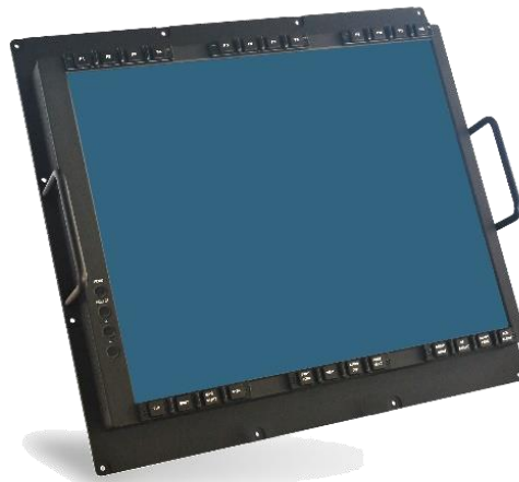
ARD19 Shown with Adapter Plate

Argon offers a 19" rugged display that is particularly suitable for Command & Control console applications where space is at a premium such as in combat & tactical vehicles, mobile shelters, and close-in naval spaces. The ARD19's small bezel size, flexible mounting configurations, configurable I/O, and universal AC/DC power supply make it a valuable solution for many mission critical applications. Of course, Argon will customize the unit to meet your exact electrical and mechanical interfaces.